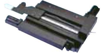
Shuttle Stage in load position